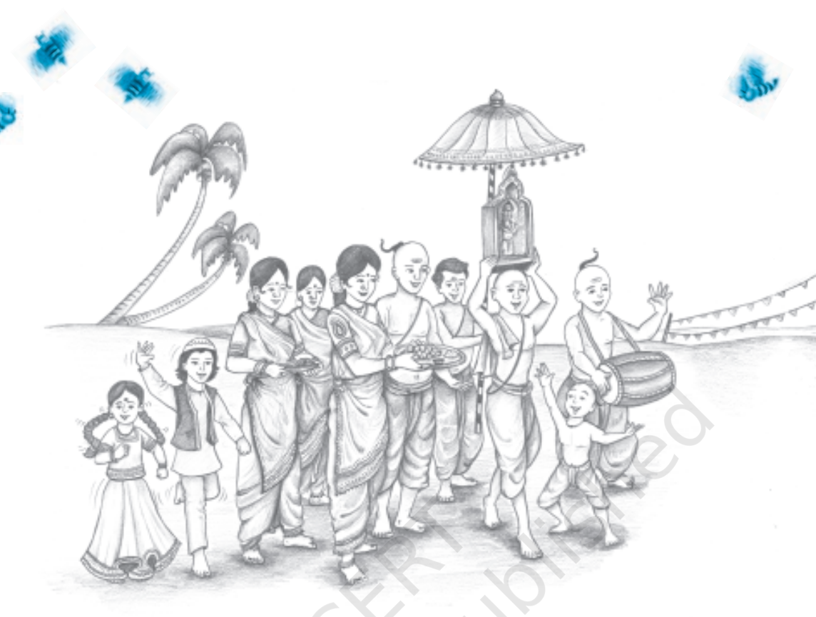
Our family used to arrange boats for carrying idols of the Lord from the temple to the marriage site.

father; Aravindan went into the business of arranging transport for visiting pilgrims; and Sivaprakasan became a catering contractor for the Southern Railways.